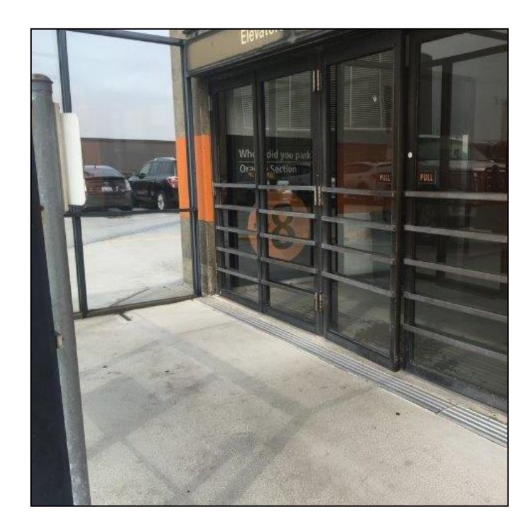
Existing 8<sup>th</sup> Floor Vestibules