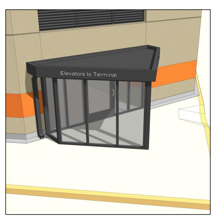
New 8<sup>th</sup> Floor Vestibules